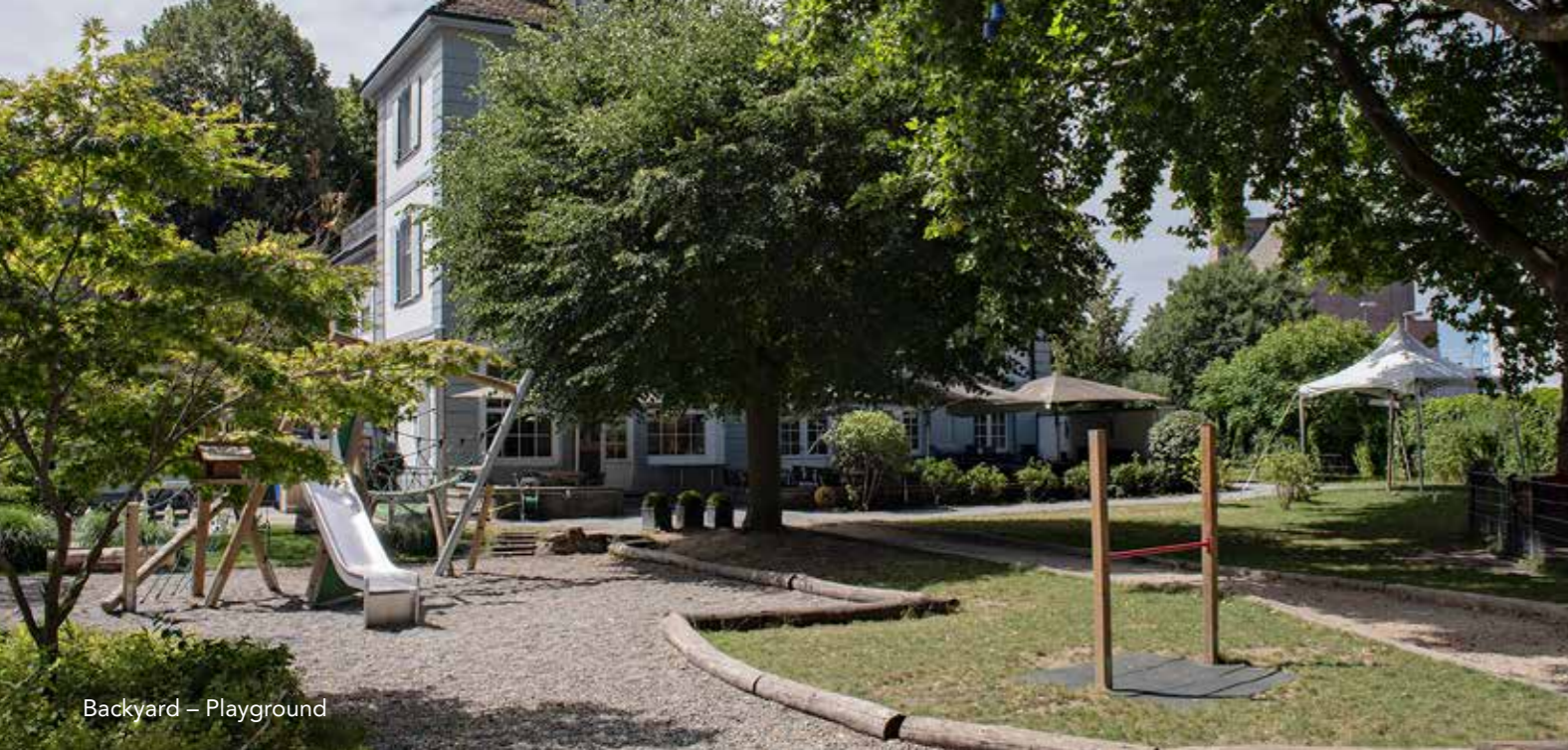
Backyard – Playground